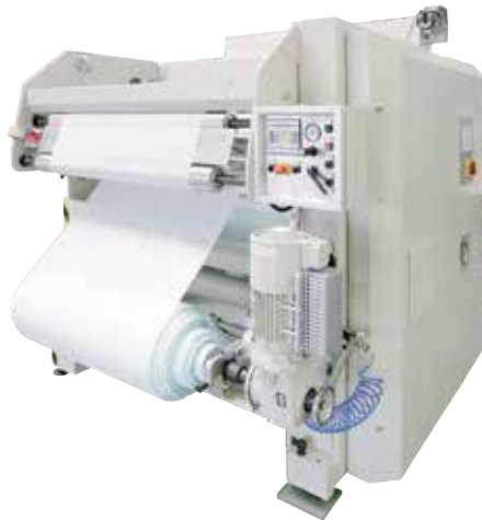
before: - faulty winding