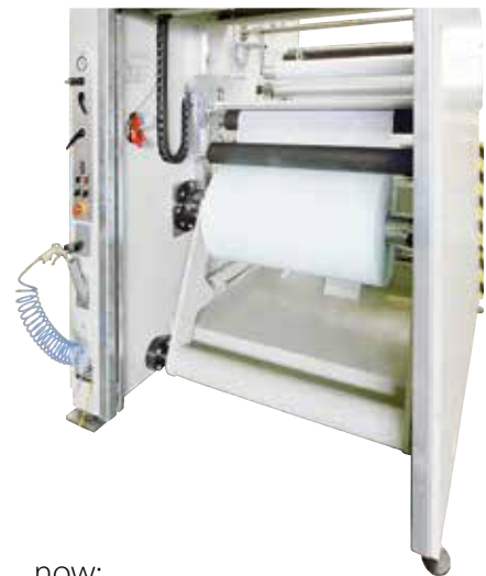
now: - straight edge winding